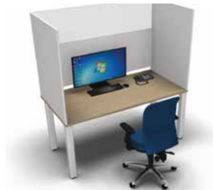
Option 3: Single straight or wave desk 1200/1400/1600/1800mm wide x 800mm deep x 600-900mm high