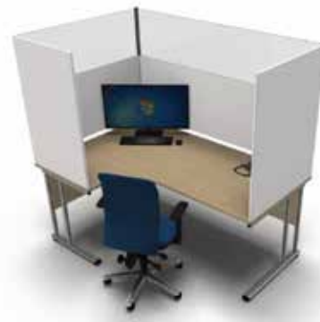
Option 1: Corner desk 1600-1800mm wide x 800/1200mm deep x 600-900mm high