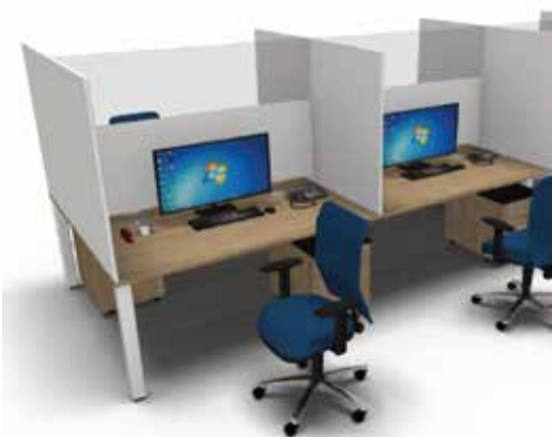
Option 2: Bench back to back desking 1200/1400/1600/1800mm wide x 800mm deep x 600-900mm high